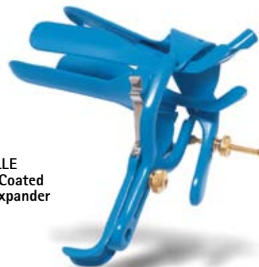
ES-16132-LLE Large LETZ-Coated Four-Way Expander

also available in uncoated stainless steel and autoclavable resin models