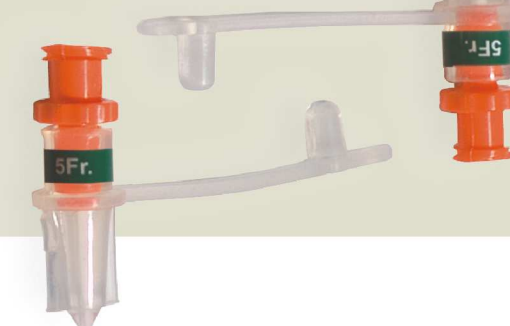
Nutri-Cath Silicone Enteral Feeding Catheters

Choice of standard luer lock connector for continuous feeding or oral dose connector for intermittent feeding.